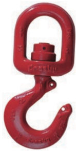
Suitable for frequent rotation under load.