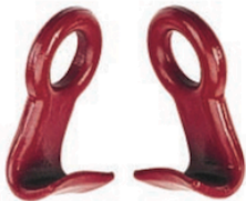
S-377 Barrel Hooks