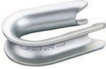
G-408 (OPEN PATTERN)